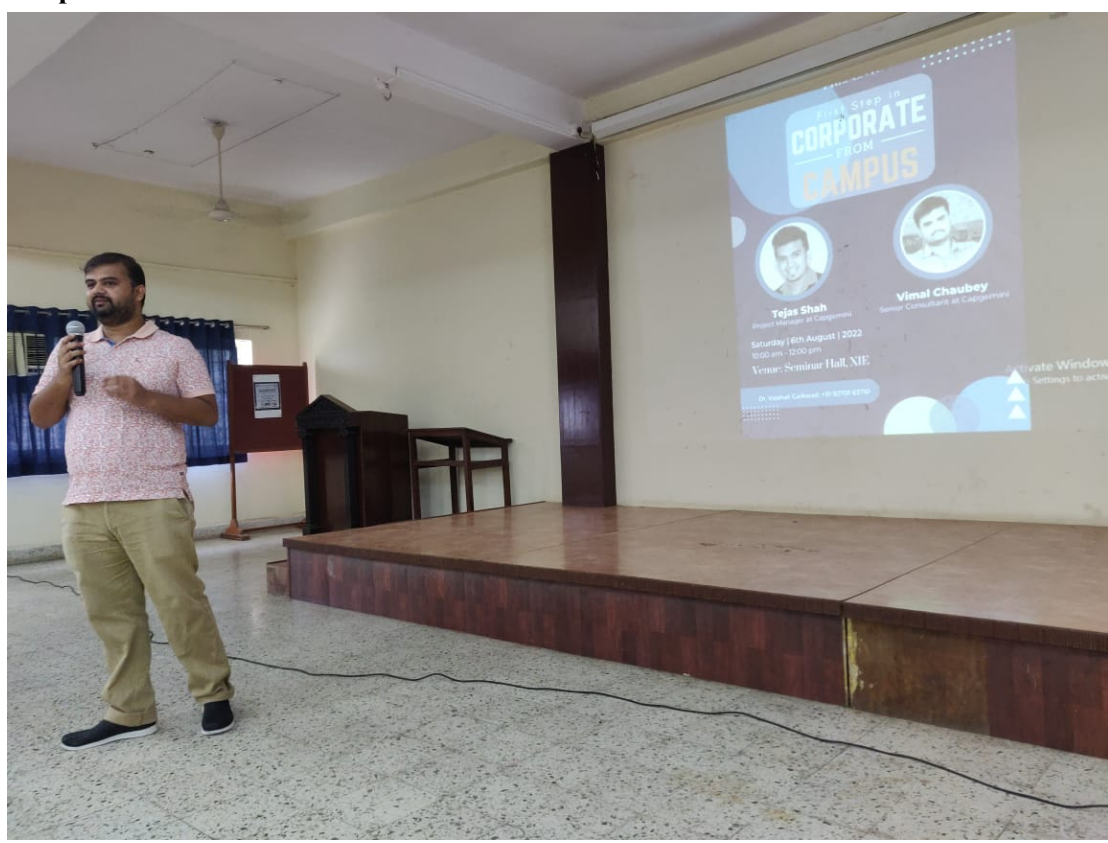
Session by Speaker