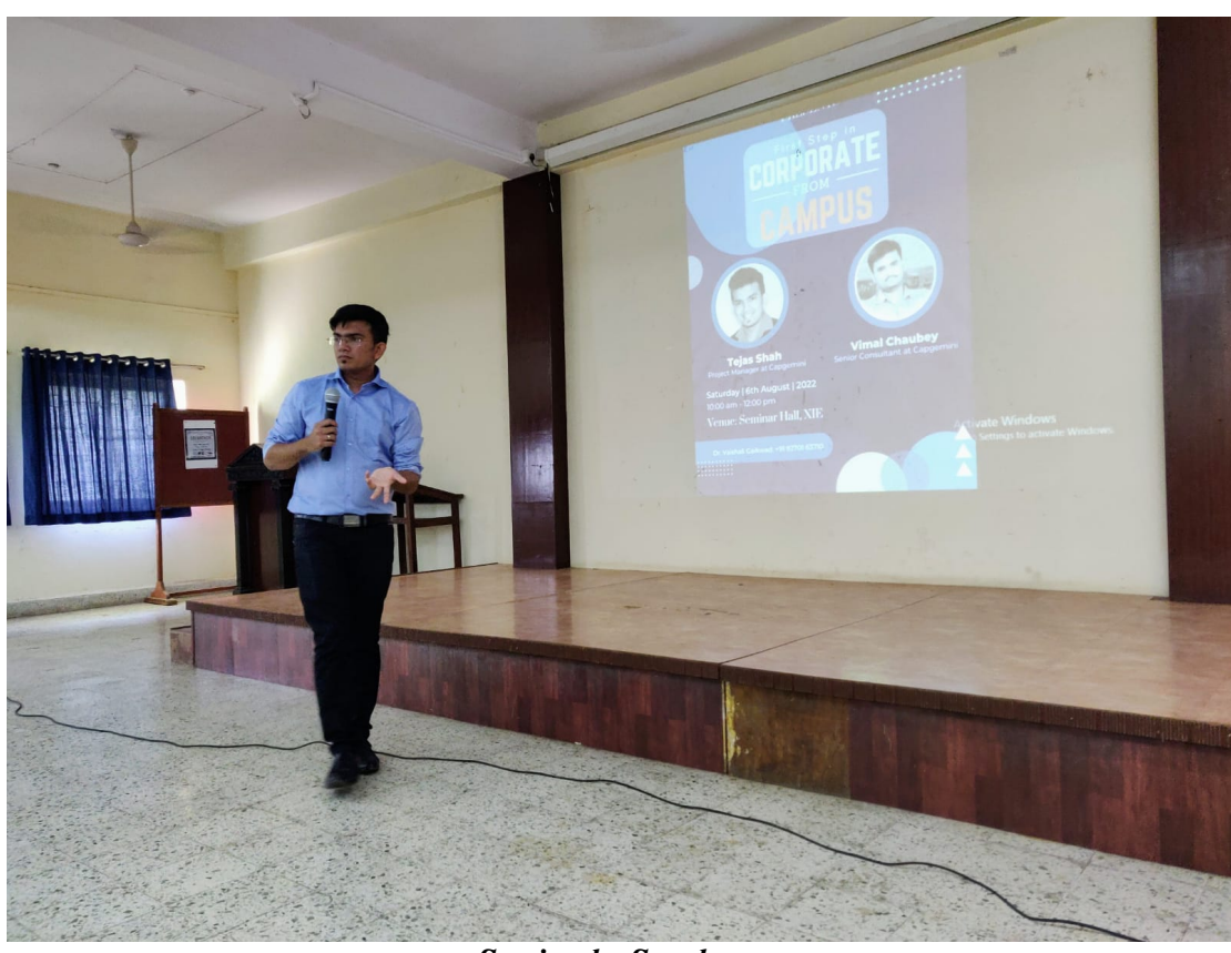
Session by Speaker